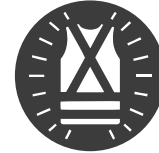
HIGH VISIBILITY CLOTHING