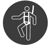
FALL ARREST HARNESS